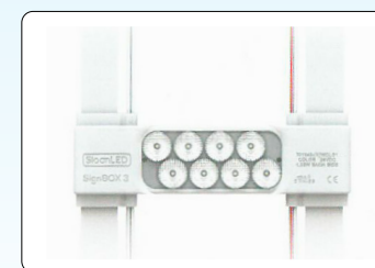
STRAPPED DOUBLE SIDED 6500K.....701946-6WDL51